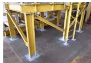
Sealed deck-support bolts