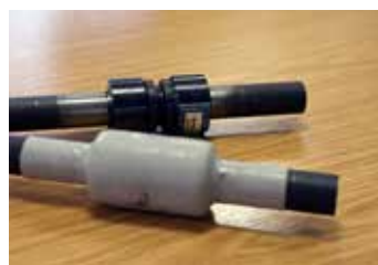
Lokrings coated in Belzona