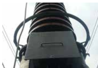
Inspection boxes protected from corrosion