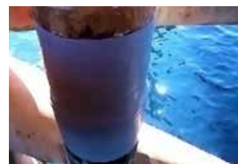
Steel/neoprene cladding bridged on a riser boot

For more information, please contact your local Belzona representative: